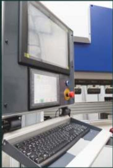
Control unit Cone TC 8 with PC screen for graphical functions.