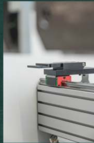
5-axis back gauge - BG5.