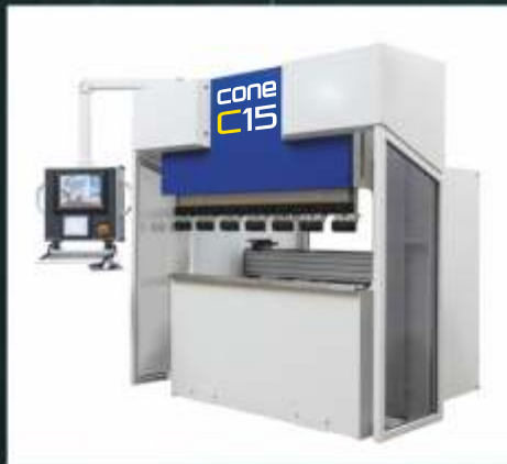
C-Series Cone C15, C-frame machine.