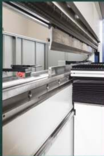
600 mm daylight (G-series). Wila tooling.