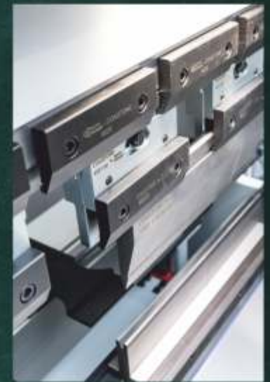
Promecam tooling (European style tooling).