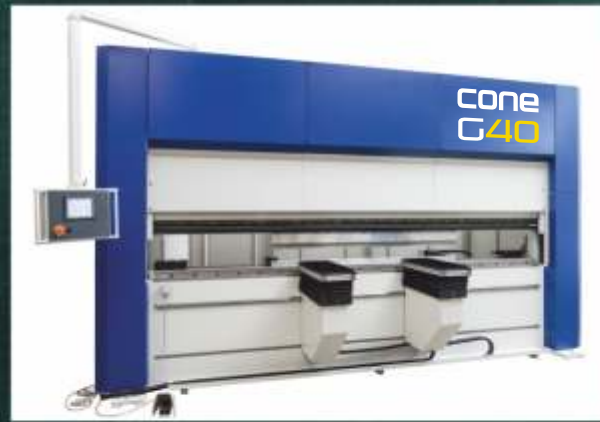
G-Series Cone G40. O-frame machine with sheet followers.