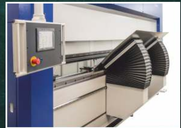
Servo electric sheet followers.